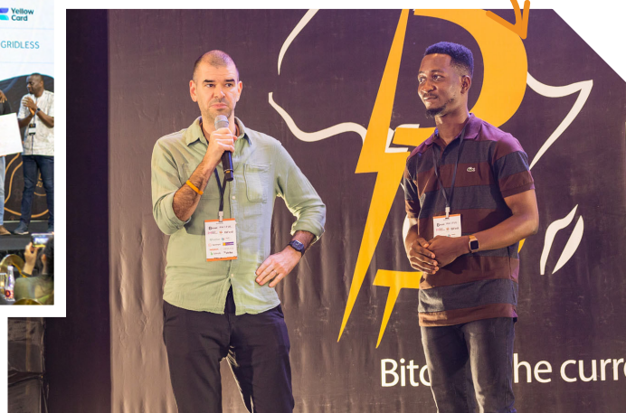
2022 Hackathon Winner